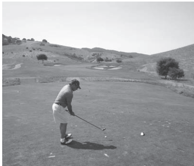
Tee time at San Juan Oaks