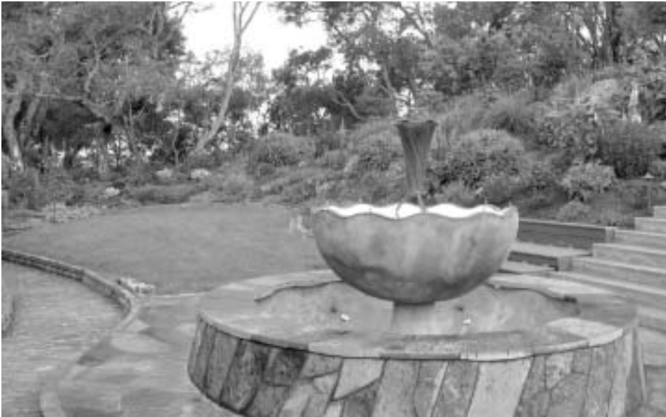
The Carter/Gamble Residence installed by Jackson Landscape, winner of the 2007 Excelsior Award.